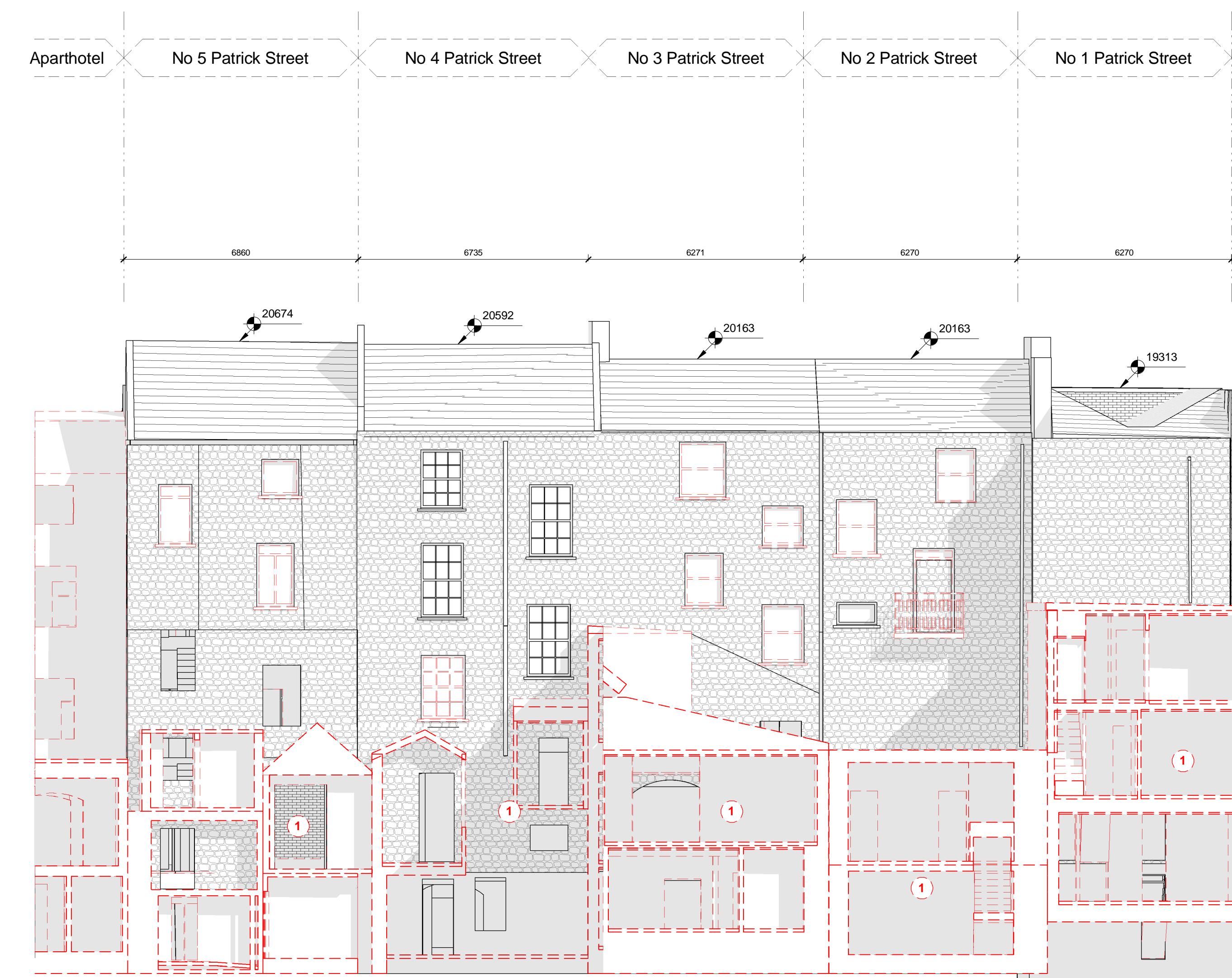
3 Existing East Elevation