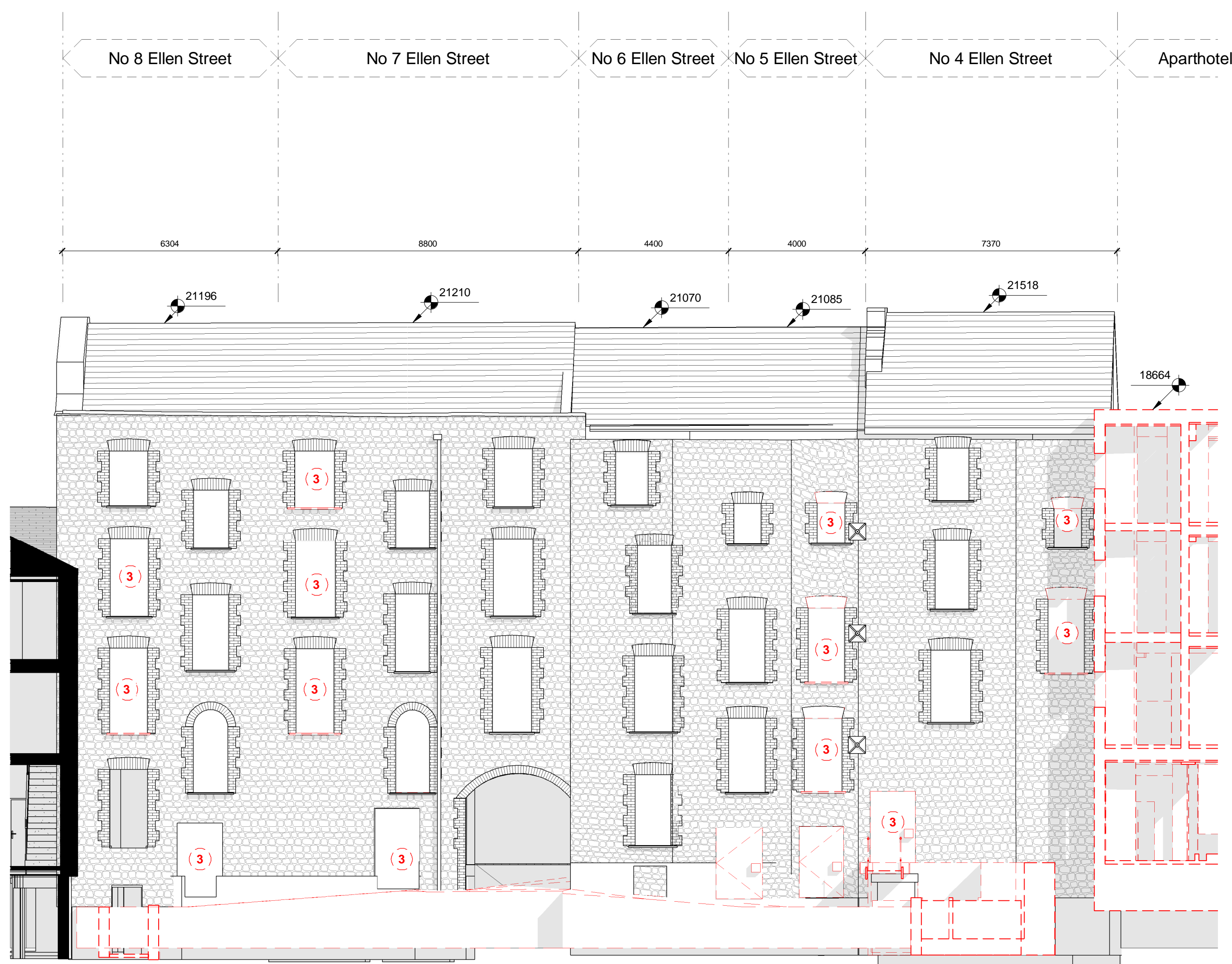
1 Existing North Elevation